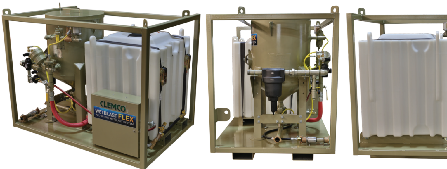
Wetblast FLEX™: All-in-One Wetblast System

Packages include FLEX Base Unit plus 50ft x 1 ¼" ID Supa™ Hose fitted with nylon holder and nylon coupling, 7/16"-orifice silicon-carbide-lined rubber-jacketed nozzle, Apollo 600 HP DLX NIOSH-approved supplied-air respirator, ClemCool air conditioner, CPF-20 breathing-air filter, Apollo 600 HP DLX with Clem-Cool air conditioner, 50 ft respirator hose, APL-600 outer lenses (pk of 25), APL-600 intermediate lenses (pk of 5), 1 pair leather gloves, abrasive-trap screens (6), coupling gaskets (pk of 10), nozzle washers (pk of 10), nylon ties (8).